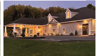
122 Waterbury Rd.